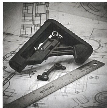
Aerospace/Military Stock Assembly Latch