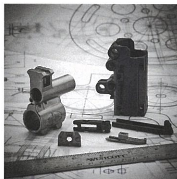
Hand Tools/Recreation Barrel Black & Catch