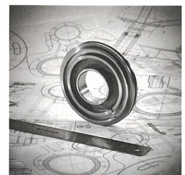
Industrial Motors/ Controls & Hydraulics Clutch Piston

Digital Images Available Upon Request Metal Powder Industries Federation, 105 College Road East, Princeton, NJ 08540-6692 609-452-7700 dschember@mpif.org