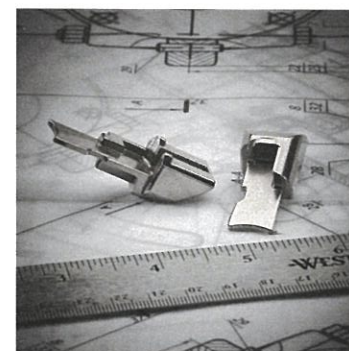
Hardware/Appliance Door Lock Bolt