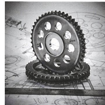
Automotive: Engine Duplex Cam Sprocket