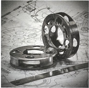
Automotive Transmission Planetary Carrier