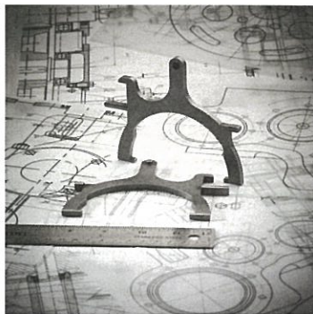
Lawn & Garden Pivot Shift Fork