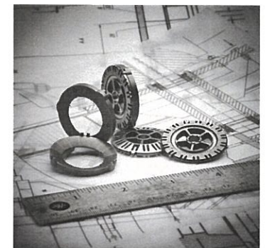
Automotive: Chassis Top Plate/Check Shim Stop