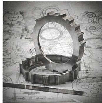
Automotive: Transmission Pocket Plate